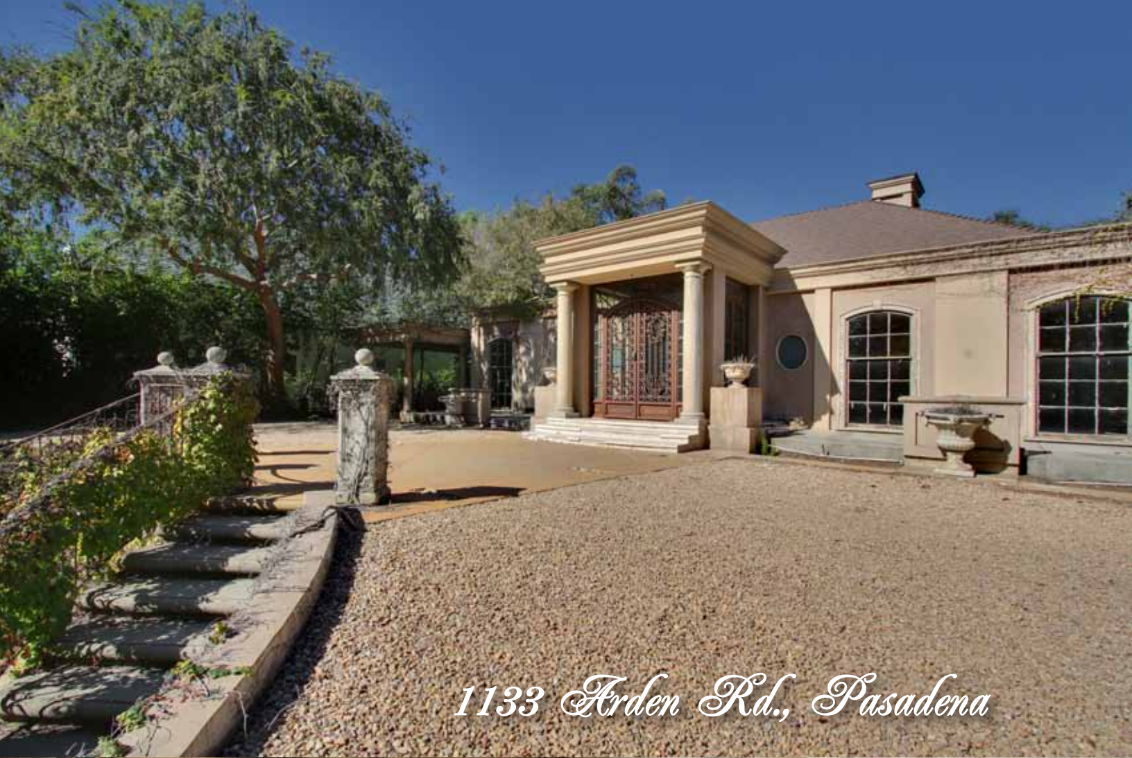
1133 Arden Rd., Pasadena