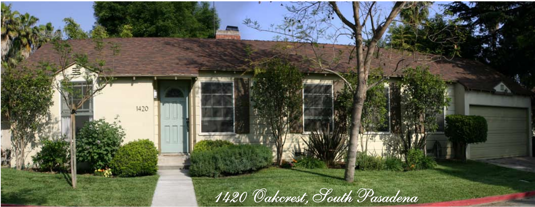
1420 Oakcrest, South Pasadena

Charming is the perfect word to describe this 1939 traditional located on a cul-de-sac in the hills of South Pasadena. A light and airy formal living room has wood floors, crown molding, tall windows and a brick fireplace. An adjoining light-filled formal dining room with bead-board and wainscoting shares its crown molding and oak floors. The kitchen is adjacent to the dining room and features updated travertine flooring and a newer Bosch dishwasher. Both generously-sized bedrooms have crown molding and oak floors, with a door to an expansive deck from the main bedroom. The bathroom has modern travertine tile flooring, yet retains its period tiles, which have been gorgeously accented by a custom mural painted by the artist/owner. Adjacent to the office/den, a family room features double-paned casement windows which open to the deck and frame its infinite tree-top view. A generous lot is a true gardener's delight with its flat grassy area in addition to the terraced landscaping which offers citrus, cherimoya, mature avocado and Ash trees. There is an unpermitted bonus room downstairs that could be another office or bedroom. There is a separate laundry room inside with a nearly-new Frigidaire washer and dryer that are included without warranty. You won't believe the ample built-in storage in the attached one-car garage and bonus room. Newly refinished hardwood floors throughout. All of this and more in the South Pas School District!